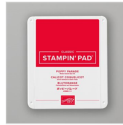
Poppy Parade Classic Stampin' Pad - 147050