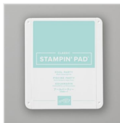
Pool Party Classic Stampin' Pad - 147107