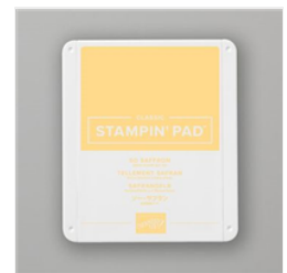
So Saffron Classic Stampin' Pad - 147109