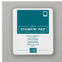
Pretty Peacock Classic Stampin' Pad - 150083