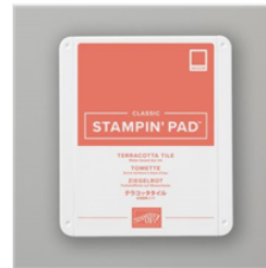
Terracotta Tile Classic Stampin' Pad - 150086