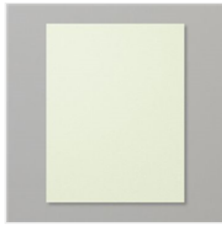
Soft Sea Foam 8-1/2" X 11" Cardstock - 146988