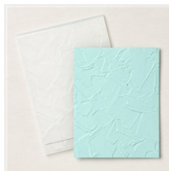
Painted Texture 3D Embossing Folder - 154317