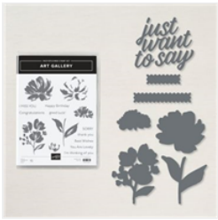
Art Gallery Bundle - 156227