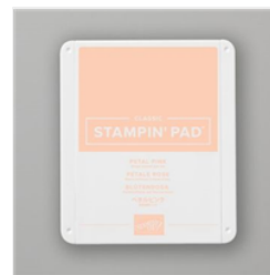
Petal Pink Classic Stampin' Pad - 147108