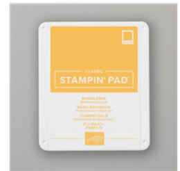
Bumblebee Classic Stampin' Pad - 153116