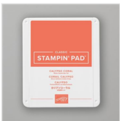
Calypso Coral Classic Stampin' Pad - 147101