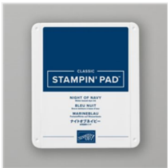
Night Of Navy Classic Stampin' Pad - 147110