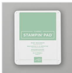
Mint Macaron Classic Stampin' Pad - 147106