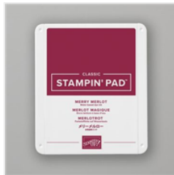
Merry Merlot Classic Stampin' Pad - 147112