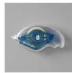
Stampin' Seal+ 149699