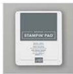
Basic Gray Classic Stampin' Pad 149165