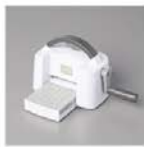
Mini Stampin' Cut & Emboss Machine 150673