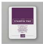
Blackberry Bliss Classic Stampin' Pad 147092