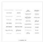
Itty Bitty Greetings Cling Stamp Set (En) 151331