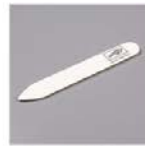
Bone Folder 102300