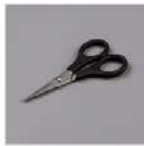
Paper Snips Scissors 103579