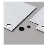
Black Stampin' Dimensionals Combo Pack 150893