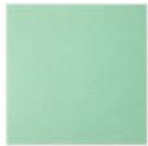
Scripty 3D Embossing Folder 149634