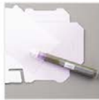
Stampin' Spritzer 126185