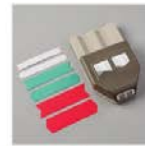
Banners Pick A Punch 153608