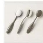
Blending Brushes 153611