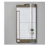
Paper Trimmer 152392