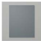
Basic Gray 8-1/2" X 11" Cardstock 121044