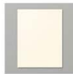
Very Vanilla 8-1/2" X 11" Cardstock 101650