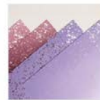
Hydrangea Hill Mercury Glass Designer Acetate 154574