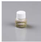
Champagne Mist Shimmer Paint 147044