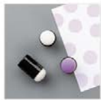
Sponge Daubers 133773