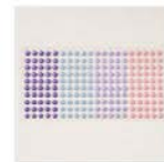
Pastel Pearls 154571