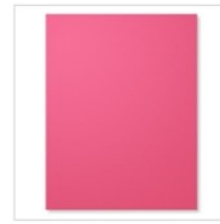
Melon Mambo 8-1/2" X 11" Cardstock