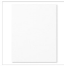
Whisper White 8-1/2" X 11" Cardstock