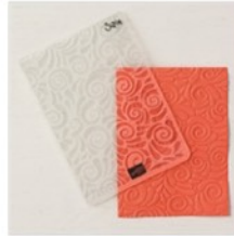
Swirls & Curls Textured Impressions Embossing Folder