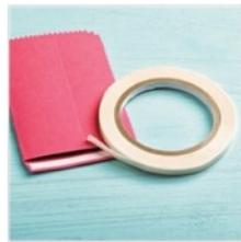
Tear & Tape Adhesive