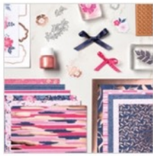
Everything Is Rosy Product Medley