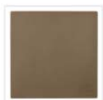
Silicone Craft Sheet 127853