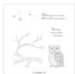
Still Night Clear-Mount Stamp Set 147670