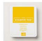
Crushed Curry Classic Stampin' Pad 147087