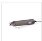
Heat Tool (Us And Canada) 129053