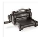
Big Shot 143263