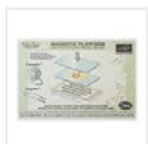
Magnetic Platform 130658