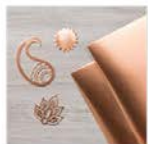
Copper Foil Sheets 142020