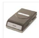
Classic Label Punch 141491