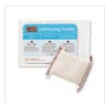
Embossing Buddy 103083