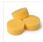
Stamping Sponges 141337