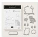
Still Night Clear-Mount Bundle 149978