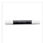
Stampin' Blends Color Lifter 144608