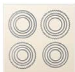
Layering Circle Framelits Dies 141705