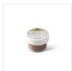
Copper Stampin' Emboss Powder 141636