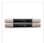
Crumb Cake Stampin' Blends Markers Combo Pack 144601