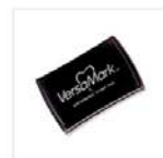
Versamark Pad 102283