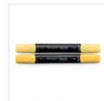
Daffodil Delight Stampin' Blends Markers Combo Pack 144603