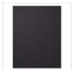
Basic Black 8-1/2" X 11" Cardstock 121045