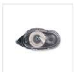
Snail Adhesive 104332