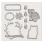
Night Owl Thinlits Dies 147920