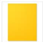
Crushed Curry 8-1/2" X 11" Cardstock 131199