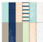
Twinkle Twinkle Designer Series Paper 146284