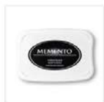
Tuxedo Black Memento Ink Pad 132708