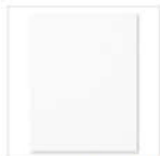
Whisper White 8-1/2" X 11" Cardstock 100730