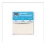
Stampin' Dimensionals 104430