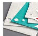
Mini Stampin' Dimensionals 144108