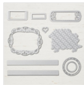
Stitched Labels Framelits Dies 146828