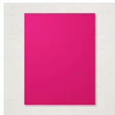
Lovely Lipstick 8-1/2" X 11" Cardstock 146970