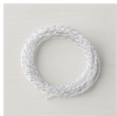
Silver Baker'S Twine 145569