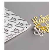
Multipurpose Adhesive Sheets 144106