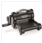
Big Shot 143263