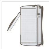
Stampin' Trimmer 126889