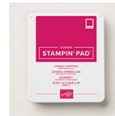
Lovely Lipstick Classic Stampin' Pad 147140