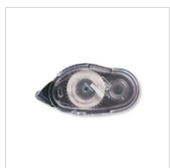
Snail Adhesive 104332