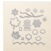
Seasonal Layers Thinlits Dies 143751