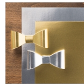
Silver Foil Sheets 132178