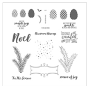
Christmas Pines Photopolymer Stamp Set 142049