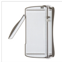
Stampin' Trimmer 126889