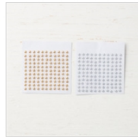
Metallic Pearls 146282