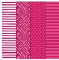
In Color 2018-2020 6" X 6" (15.2 X 15.2 Cm) Designer Series Paper 146963