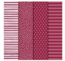
Neutrals 6" X 6" (15.2 X 15.2 Cm) Designer Series Paper 146967