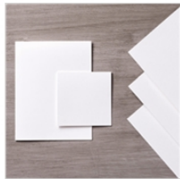
Whisper White 8-1/2" X 11" Thick Cardstock 140272