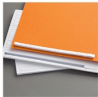
Foam Adhesive Strips 141825