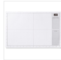
Grid Paper 130148