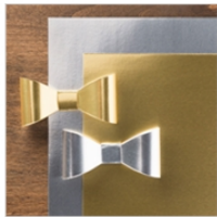
Silver Foil Sheets 132178