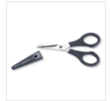
Paper Snips 103579