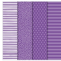
Brights 6" X 6" (15.2 X 15.2 Cm) Designer Series Paper 146964