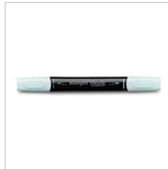
Pool Party Light Stampin' Blends Marker