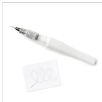
Clear Wink Of Stella