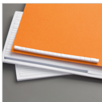
Foam Adhesive Strips