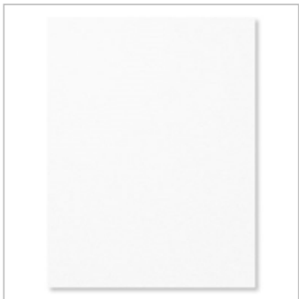
Whisper White 8-1/2" X 11" Cardstock