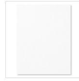
Whisper White 8-1/2" X 11" Cardstock 100730