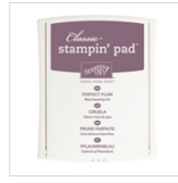
Perfect Plum Classic Stampin' Pad 126963