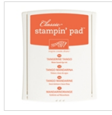
Tangerine Tango Classic Stampin' Pad 126946