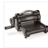
Big Shot 143263