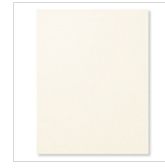
Very Vanilla 8-1/2" X 11" Cardstock 101650