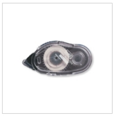
Snail Adhesive 104332