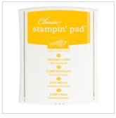
Crushed Curry Classic Stampin' Pad 131173