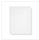
Vellum 8-1/2" X 11" Cardstock 101856