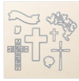
Cross Of Hope Framelits Dies 145654