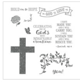
Hold On To Hope Clear-Mount Stamp Set 145780