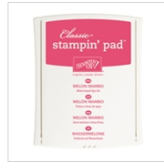
Melon Mambo Classic Stampin' Pad 126948