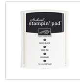
Basic Black Archival Stampin' Pad 140931