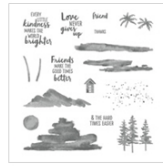
Waterfront Photopolymer Stamp Set 146386