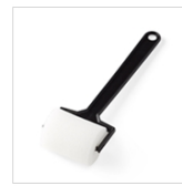
Sponge Brayers 141714