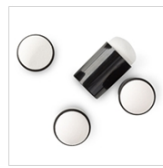
Sponge Daubers 133773