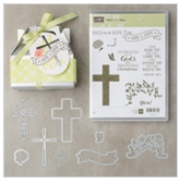
Hold On To Hope Clear-Mount Bundle 145970