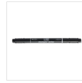
Basic Black Stampin' Write Marker 100082