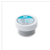
Silver Stampin' Emboss Powder 109131