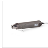
Heat Tool (Us And Canada) 129053