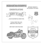
One Wild Ride Clear- Mount Stamp Set 141724