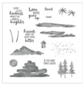
Waterfront Photopolymer Stamp Set 146386