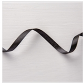
Basic Black 3/8" Shimmer Ribbon 144129