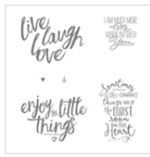
Layering Love Clear- Mount Stamp Set 141965