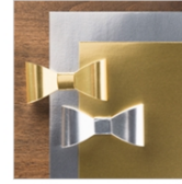
Gold Foil Sheets 132622