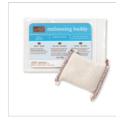
Embossing Buddy 103083