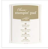
Crumb Cake Classic Stampin' Pad 126975