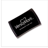
Versamark Pad 102283