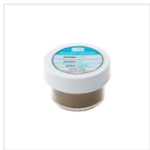
Gold Stampin' Emboss Powder 109129