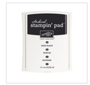
Basic Black Archival Stampin' Pad 140931