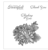
Heartfelt Blooms Clear -Mount Stamp Set 147202