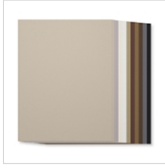
Neutrals 8-1/2" X 11" Cardstock 131191