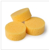
Stamping Sponges 141337