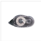
Snail Adhesive 104332