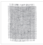
Burlap Clear-Mount Stamp Set 143982