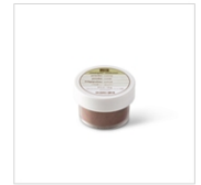
Copper Stampin' Emboss Powder 141636