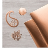
Copper Foil Sheets 142020