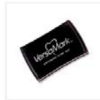
Versamark Pad 102283