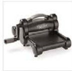
Big Shot 143263