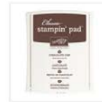
Chocolate Chip Classic Stampin' Pad 126979