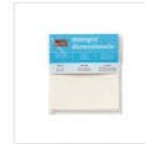
Stampin' Dimensionals 104430