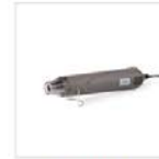
Heat Tool (Us And Canada) 129053