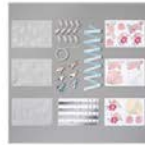
Sweet Soirée Embellishment Kit 145578