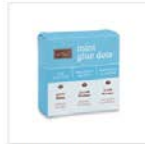
Mini Glue Dots 103683