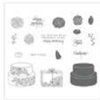
Cake Soirée Clear-Mount Stamp Set 145745