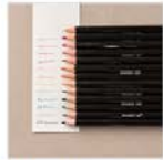
Watercolor Pencils 141709