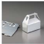
Silver Mini Gable Boxes 145568