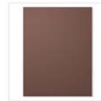
Chocolate Chip 8-1/2" X 11" Cardstock 102128