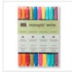
Brights Stampin' Write Markers 131259