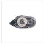
Snail Adhesive 104332