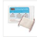
Embossing Buddy 103083