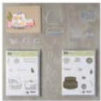
Cake Soiree Clear-Mount Bundle 147627