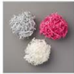
Sweet Soirée Ready Shreddie 145562