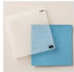
Scattered Sequins Dynamic Textured Impressions Embossing Folder 145649