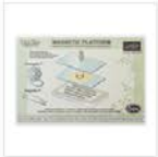
Magnetic Platform 130658