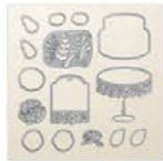
Sweet Cake Framelits Dies 145617