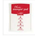
Real Red Classic Stampin' Pad 126949