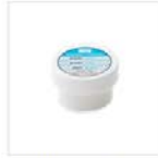
White Stampin' Emboss Powder 109132