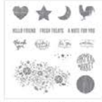
Wood Words Clear-Mount Stamp Set 143928