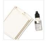
Whisper White Uninked Craft Stampin' Pad & Refill 145406