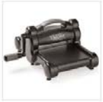
Big Shot 143263