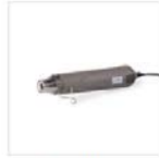
Heat Tool (Us And Canada) 129053