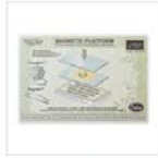
Magnetic Platform 130658