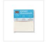
Stampin' Dimensionals 104430