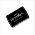
Versamark Pad 102283