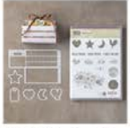
Wood Words Clear-Mount Bundle 145316