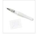
Clear Wink Of Stella Glitter Brush 141897