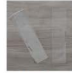
2" X 8" (5.1 X 20.3 Cm) Cellophane Bags 141703