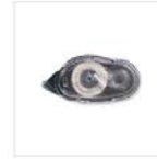
Snail Adhesive 104332