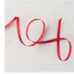
Real Red 1/8" (3.2 Mm) Solid Ribbon 144631