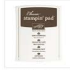
Early Espresso Classic Stampin' Pad 126974