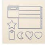
Wood Crate Framelits Dies 143730