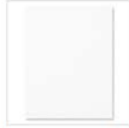
Whisper White 8-1/2" X 11" Cardstock 100730