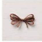
1/4" Copper Trim 144179