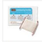
Embossing Buddy 103083