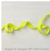
Lemon Lime Twist 1/2" Finely Woven Ribbon 144135