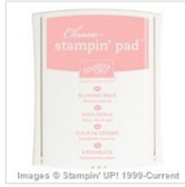
Blushing Bride Classic Stampin' Pad 131172