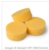
Stamping Sponges 141337