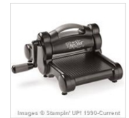
Big Shot 143263