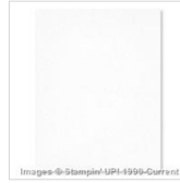
Shimmery White 8-1/2" X 11" Cardstock 101910