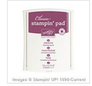
Fresh Fig Classic Stampin' Pad 144082