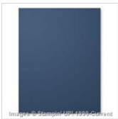
Night Of Navy 8-1/2" X 11" Cardstock 100867