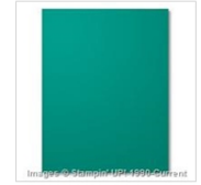
Tranquil Tide 8-1/2" X 11" Cardstock 144246