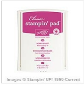
Berry Burst Classic Stampin' Pad 144083