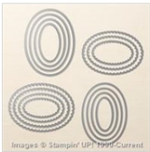
Layering Ovals Framelits Dies 141706