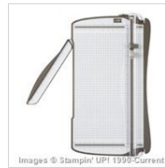
Stampin' Trimmer 126889