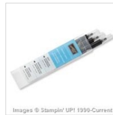
Blender Pens 102845