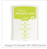
Lemon Lime Twist Classic Stampin' Pad 144086