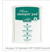
Tranquil Tide Classic Stampin' Pad 144085