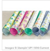
Naturally Eclectic Designer Series Paper 144185