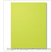
Lemon Lime Twist 8-1/2" X 11" Cardstock 144245