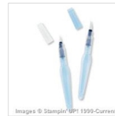
Aqua Painters 103954