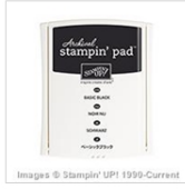
Basic Black Archival Stampin' Pad 140931