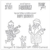
You've Got Style Clear-Mount Stamp Set 143898