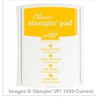
Crushed Curry Classic Stampin' Pad 131173