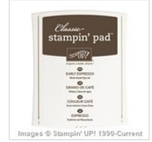
Early Espresso Classic Stampin' Pad 126974