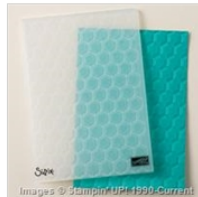
Hexagons Dynamic Textured Impressions Embossing Folder 143231