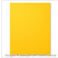
Crushed Curry 8-1/2" X 11" Cardstock 131199