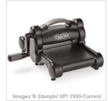
Big Shot 143263