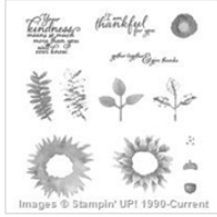
Painted Harvest Photopolymer Stamp Set 144783