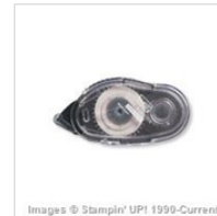
Snail Adhesive 104332