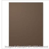
Early Espresso 8-1/2" X 11" Cardstock 119686