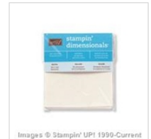
Stampin' Dimensionals 104430