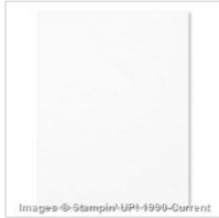
Whisper White 8-1/2" X 11" Cardstock 100730