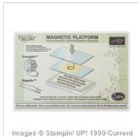
Magnetic Platform 130658