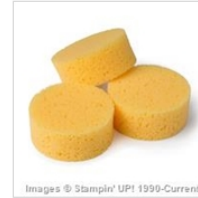
Stamping Sponges 141337