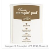
Soft Suede Classic Stampin' Pad 126978