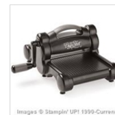
Big Shot 143263