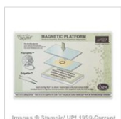
Magnetic Platform 130658