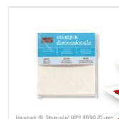
Stampin' Dimensionals 104430