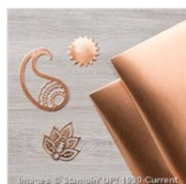
Copper Foil Sheets 142020