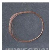
Copper Metallic Thread 141696