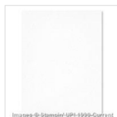
Shimmery White 8- 1/2" X 11" Cardstock 101910