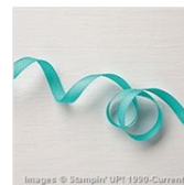
Bermuda Bay 3/8" Mini Chevron Ribbon 144198