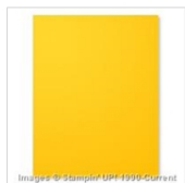
Crushed Curry 8-1/2" X 11" Cardstock 131199