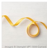
Crushed Curry 3/8" Mini Chevron Ribbon 144197