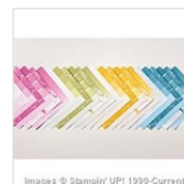
Color Theory Designer Series Paper Stack 144193