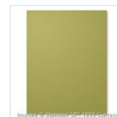
Old Olive 8-1/2" X 11" Cardstock 100702