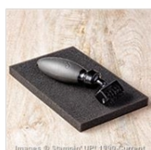
Big Shot Die Brush - New Configuration 144262