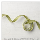
Old Olive 3/8" Mini Chevron Ribbon 144196