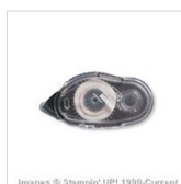
Snail Adhesive 104332