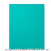
Bermuda Bay 8-1/2" X 11" Cardstock 131197