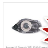
Snail Adhesive 104332