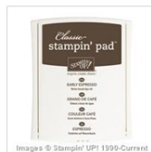
Early Espresso Classic Stampin' Pad 126974