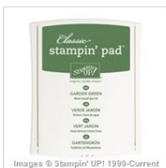
Garden Green Classic Stampin' Pad 126973