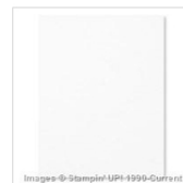
Whisper White 8-1/2" X 11" Cardstock 100730