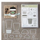
Coffee Café Photopolymer Bundle 145331