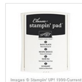
Basic Black Classic Stampin' Pad 126980