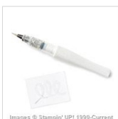
Clear Wink Of Stella Glitter Brush 141897