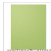
Pear Pizzazz 8-1/2" X 11" Cardstock 131201