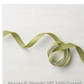
Old Olive 3/8" Mini Chevron Ribbon 144196