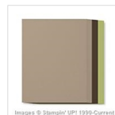
Coffee Break 8-1/2" X 11" Cardstock Pack 144156