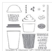
Coffee Café Photopolymer Stamp Set 143677