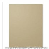
Crumb Cake 8-1/2" X 11" Cardstock 120953