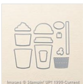
Coffee Cups Framelits Dies 143745