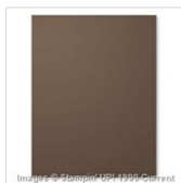
Early Espresso 8-1/2" X 11" Cardstock 119686