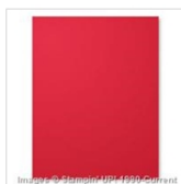
Real Red 8-1/2" X 11" Cardstock 102482