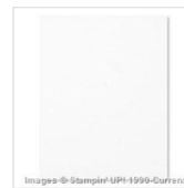
Whisper White 8-1/2" X 11" Cardstock 100730