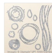
Swirly Scribbles Thinlits Dies 141497