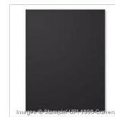
Basic Black 8-1/2" X 11" Cardstock 121045