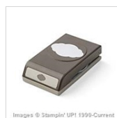
Pretty Label Punch 143715