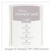
Smoky Slate Classic Stampin' Pad 131179