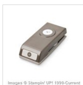
3/4" (1.9 Cm) Circle Punch 119873