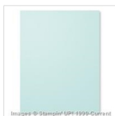
Soft Sky 8-1/2" X 11" Cardstock 131203