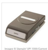
Classic Label Punch 141491