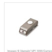
1/2" (1.3 Cm) Circle Punch 119869