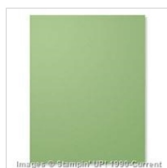
Wild Wasabi 8-1/2" X 11" Cardstock 108641