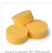
Stamping Sponges 141337