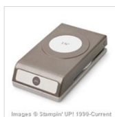
1-3/4" (4.4 Cm) Circle Punch 119850