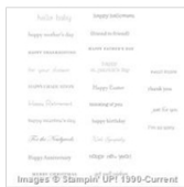
Teeny Tiny Wishes Wood-Mount Stamp Set 128748