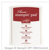
Cherry Cobbler Classic Stampin' Pad 126966