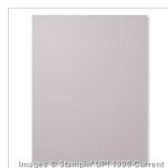
Smoky Slate 8-1/2" X 11" Cardstock 131202