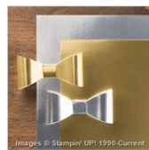
Silver Foil Sheets 132178