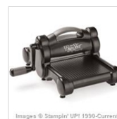
Big Shot 143263