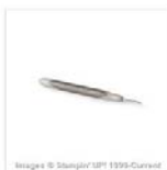
Paper-Piercing Tool 126189