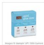
Mini Glue Dots 103683