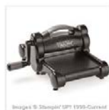
Big Shot 143263