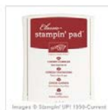
Cherry Cobbler Classic Stampin' Pad 126966