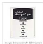
Basic Black Archival Stampin' Pad 140931