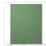
Garden Green 8-1/2" X 11" Cardstock 102584