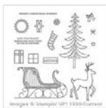
Santa's Sleigh Photopolymer Stamp Set 142057