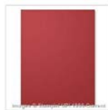
Cherry Cobbler 8-1/2" X 11" Cardstock 119685