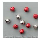
Mini Jingle Bells 142002