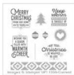
Wrapped In Warmth Clear-Mount Stamp Set 142054