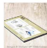
Precision Base Plate 139684