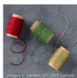
Baker's Twine Trio Pack 141999