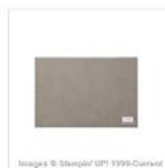
Stampin' Pierce Mat 126199