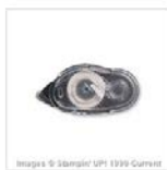
Snail Adhesive 104332