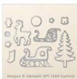
Santa's Sleigh Dies Thinlits 140278