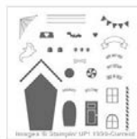
Sweet Home Photopolymer Stamp Set 140936