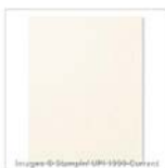
Very Vanilla 8-1/2" X 11" Cardstock 101650