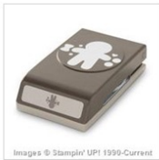
Cookie Cutter Builder Punch 140396