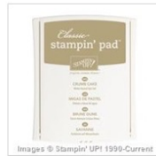
Crumb Cake Classic Stampin' Pad 126975