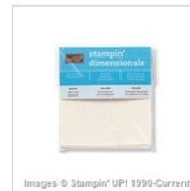
Stampin' Dimensionals 104430