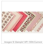
Candy Cane Lane Designer Series Paper 141981