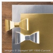
Silver Foil Sheets 132178