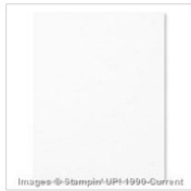
Whisper White 8-1/2" X 11" Cardstock 100730