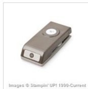
3/4" (1.9 Cm) Circle Punch 119873