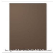
Early Espresso 8-1/2" X 11" Cardstock 119686