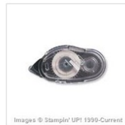
Snail Adhesive 104332