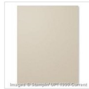
Sahara Sand 8-1/2" X 11" Cardstock 121043