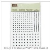
Rhinstone Basic Jewels 119246