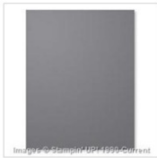
Basic Gray 8-1/2" X 11" Cardstock 121044