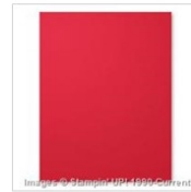
Real Red 8-1/2" X 11" Cardstock 102482