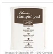
Early Espresso Classic Stampin' Pad