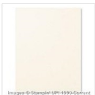
Very Vanilla 8-1/2" X 11" Cardstock