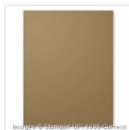
Soft Suede 8-1/2" X 11" Cardstock