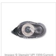
Snail Permanent Adhesive