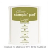
Old Olive Classic Stampin' Pad