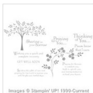
Thoughts & Prayers Clear-Mount Stamp Set