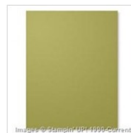
Old Olive 8-1/2" X 11" Cardstock