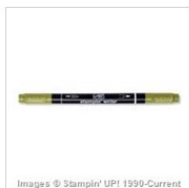
Old Olive Stampin' Write Marker