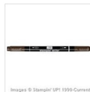
Early Espresso Stampin' Write Marker