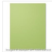
Pear Pizzazz 8-1/2" X 11" Cardstock 131201 Price: $7.00