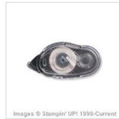
Snail Permanent Adhesive 104332 Price: $7.00