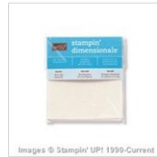
Stampin' Dimensionals 104430 Price: $4.00