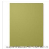
Old Olive 8-1/2" X 11" Cardstock 100702 Price: $7.00