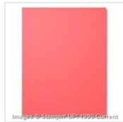
Watermelon Wonder 8 -1/2" X 11" Cardstock 138334 Price: $7.00