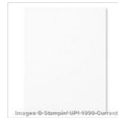
Whisper White 8-1/2" X 11" Cardstock 100730 Price: $8.50