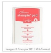
Watermelon Wonder Classic Stampin' Pad 138323 Price: $6.50