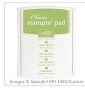
Pear Pizzazz Classic Stampin' Pad 131180 Price: $6.50