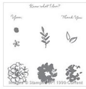
What I Love Photopolymer Stamp Set 141276 Price: $0.00