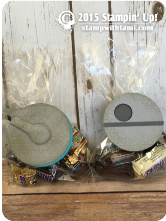
Candy Treat Bags