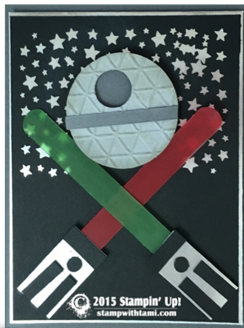
Death Star Light Saber Card