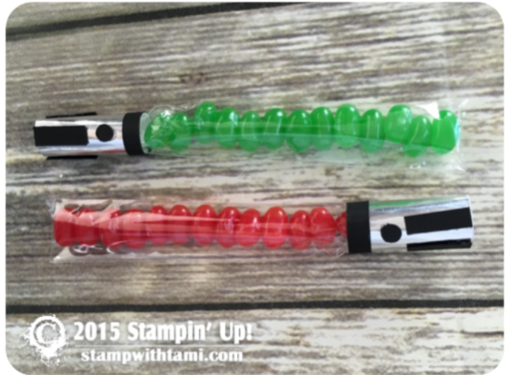
Jelly Belly Light Sabers