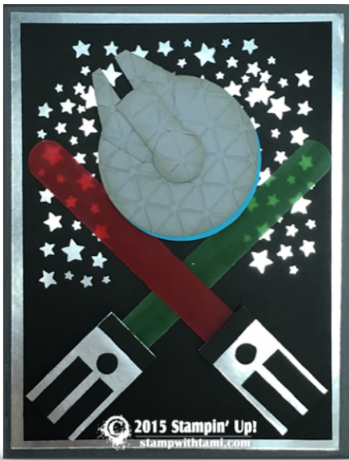
Millennium Falcon Light Saber Card